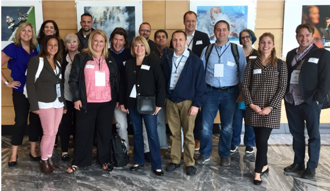
Innovation Mission Participants at Gannett – May 2017